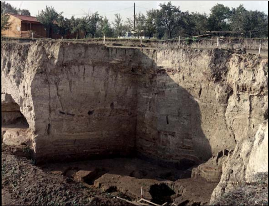
Figure 1 – The vertical section of the site of Vinča