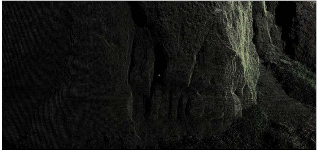
Figure 5 – Cloud of points from the Vinča profile