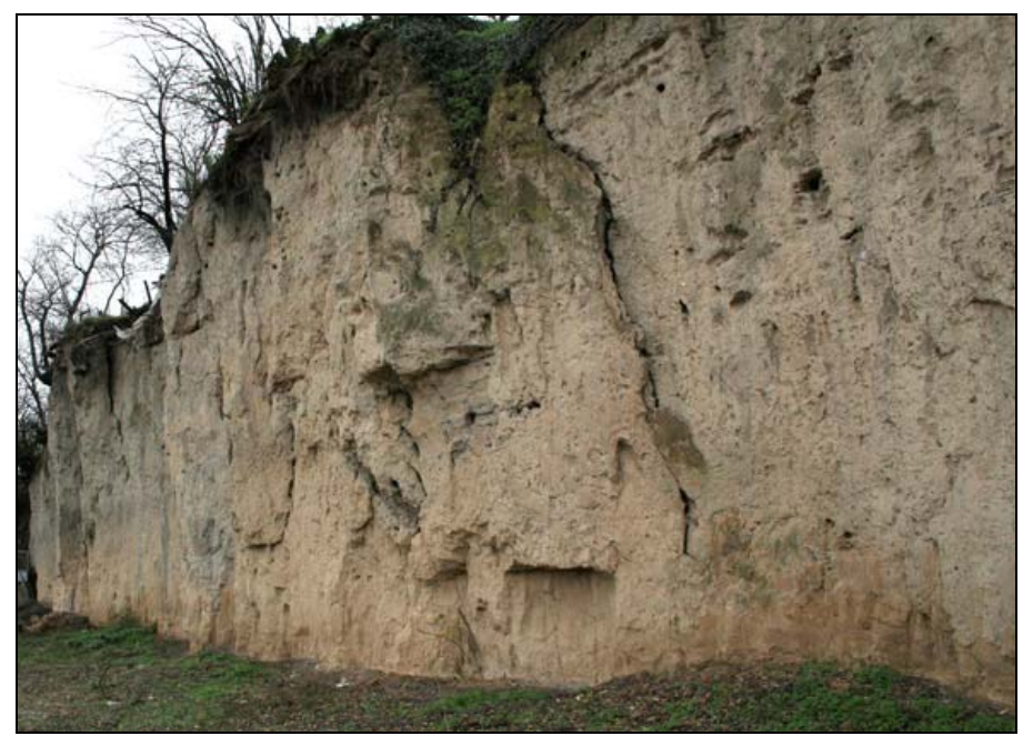
Figure 2 – Deterioration of the vertical section