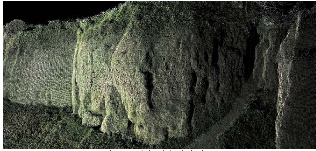
Figure 7 – Colored cloud of points