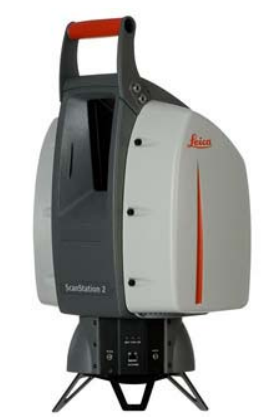
Figure 4 – Leica ScanStation 2