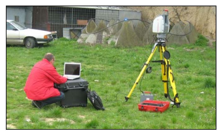
Figure 3 – April 2008, 3D scanning at Vinča