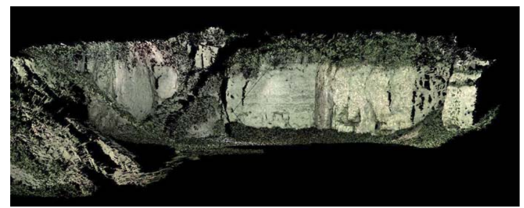
Figure 9 – A part of the 3D scan of the site of Vinča