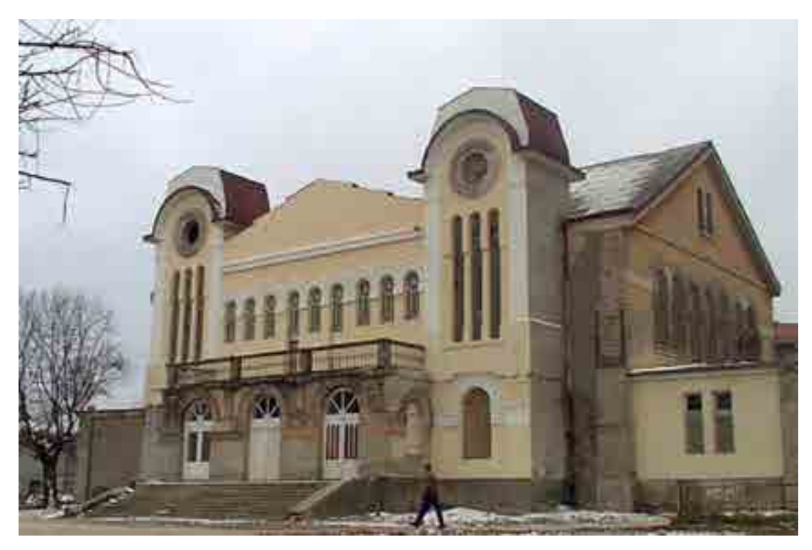
Fig. 3. Momir Korunović, Sokol house in Kumanovo, 1931.

manovo from 1931 (Kadijević 1996: 71–72). (Fig. 3) Sokol house in Uroševac also has elements of traditional architecture, such as a doksat, a four-sloped roof and an arcade porch (Kadijević 1997: 122–123). Apart from these examples, Korunović projected a certain number of Sokol houses on the teritory of Bosnia and Hercegovina which were inspiried by local architecture, such as Sokol house in Bijeljina (Kadijević 1997: 308).