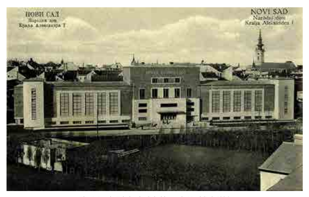
Fig. 5. Đorđe Tabaković, Sokol house in Novi Sad, 1936.