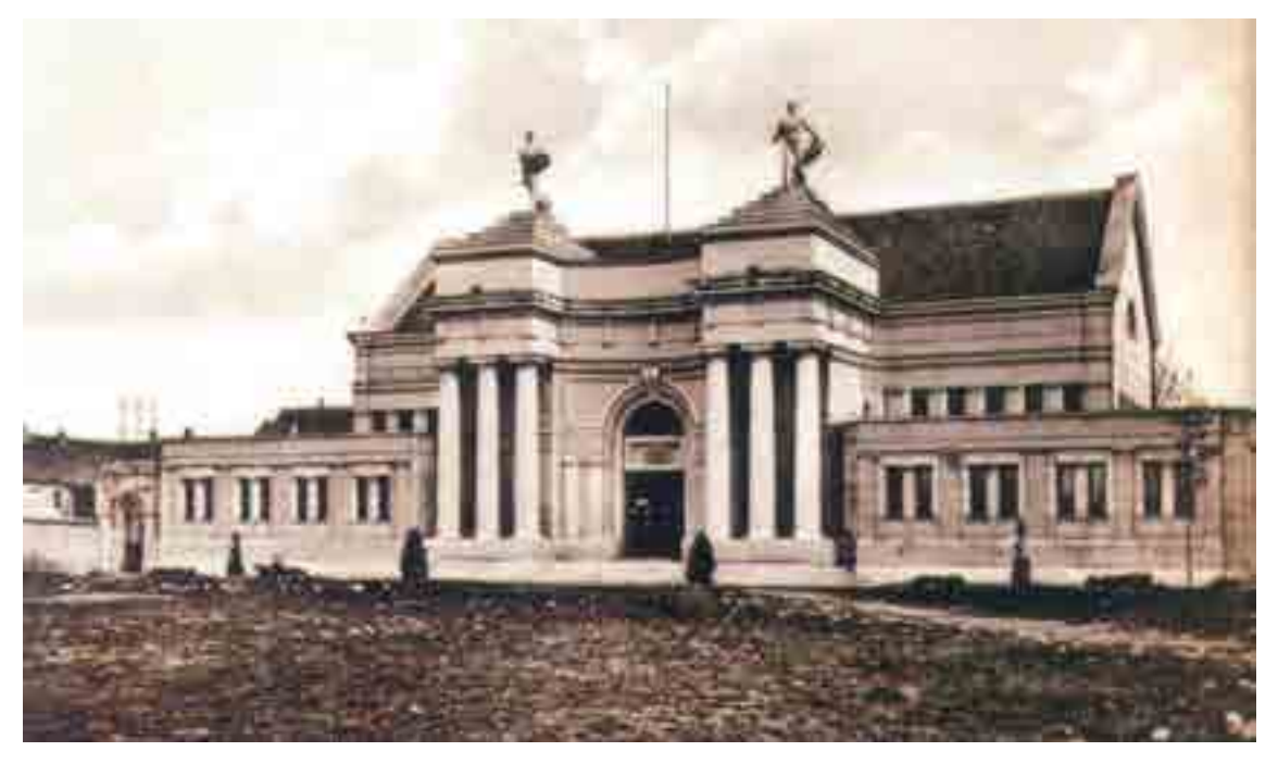
Fig. 2. Dragiša Brašovan, Sokol house in Zrenjanin, 1925.

Korunović applied monumental geometrical shapes that were inspired by folklore ornaments. Many of his Sokol houses in correspond with local heritage, like Sokol house in Ku-