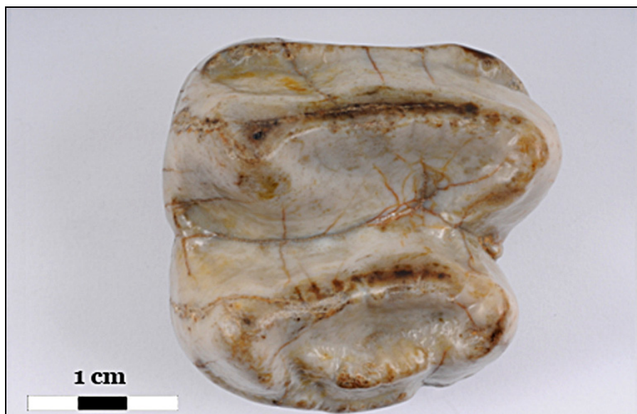
Fig. 2. - Deinotherium giganteum from fluvial deposits of the Zapadna Morava River in Adrani, near Kraljevo (central Serbia). Labial views of left M3 presented in the text.