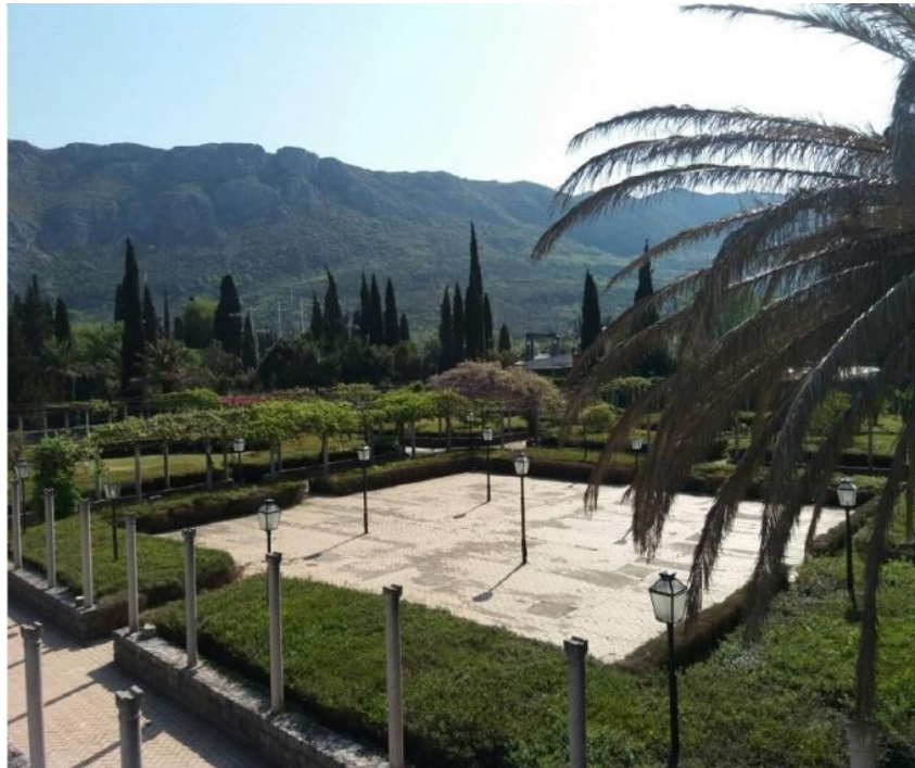
Fig 2. The Garden of the Sorkočević Villa in Rijeka Dubrovačka

contributed to the unity of the garden and the building: it led to the entrance of the house and created the green porch in front of it, which symbolized the extension of the house in the garden space (nature). 41 The pergola was richly branched in order to link the house with all the parts of the garden area. Thanks to it, the garden became an intimate place suitable for long walks. The structure had an important role in the dialogue between landscape and architecture: everything which was built above the pergola was visible from the fields and the sea, and by extension present in natural scenery. 42 Pergolas