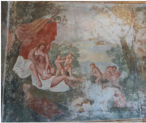
Fig 7. The Death of Adonis

imaginary Arcadia of the Sorkočević family.