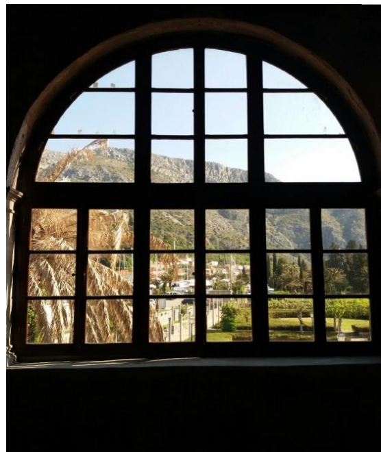
Fig 8. The view from the gallery

and reality, which affected the special impression of the natural scenery. Moreover, with the marks of symbolical family presence in this space – through the paintings in the gallery and the coat of arms on the facade – the owners of the Villa became the characters of their own Arcadia.