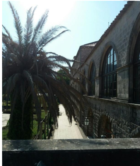
Fig. 6 The gallery

Some baroque gardens had illusionistic fresco decoration in Dubrovnik, which complemented the world of nature with bucolic, allegorical and mythological motifs. 67 That kind of painting wasn't directly present in Sorkočević's yard with a reason – the walls in the baroque gallery have already been decorated with frescoes. Being used as belvedere – opened into the garden space with monumental windows – the painted gallery walls thus complemented the yard zone.