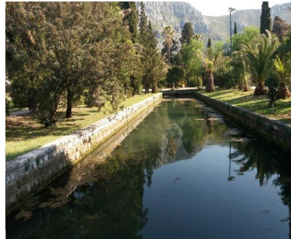
Fig 4. Fishponds

The connection with the natural scenery was visible in the architecture of the Sorkočević garden since the first stages of building. There were holes in the fence wall which is separating the garden and the sea, and they indicated the orientation toward the water and the intention of opening unto the landscape. 58 The moderate high wall is another indicator of the same idea – it doesn't interrupt the view and presence of natural scenery in the garden. 59 During the Baroque, wide panoramas in properties were not usual, but gardens included new architectural contents: viewpoints in architecture ( loggias and terraces) and exterior stairs which connected the architecture with nature. 60 Throughout time, nature was more and more liberated from architectural domination, which was