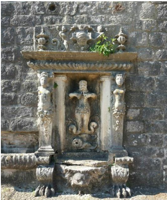
Fig 3. The wall fountain with the sculpture of Triton and the coat of arms

inspired with life by the sea. The Renaissance poet Petar Hektorović used a motif of water in the decoration of his fishpond in villa Tvrđalj to memorize moralistic values, as well as in Fishing and Fishermen's Conversation (Ribanje i ribarsko prigovaranje) , his complex ecloga piscatoria . 55 Fishing was practically and symbolically important for the life in Dubrovnik, and thus also for the Sorkočević family. Fishponds, which „imitated the nature”, make a large part of the Sorkočević property. 56 They are connected with the garden of the Sorkočević villa with canals. For the local community, these structures had the same symbolical and aesthetic quality as the „water-mirrors”. 57