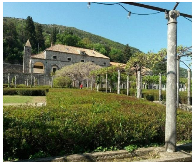
Fig.1. The Sorkočević Villa in Rijeka Dubrovačka

were linked to the intimate vision of life in summer houses in Rijeka Dubrovačka. 28 The concept of Italian Renaissance garden was simultaneously spread in Ragusa. 29 Based on bello ordine in architectural composition, Ragusan gardens were fenced garden spaces, organized in relation to the main walkaway – cut by crossing paths, which resulted with a strict orthogonal layout. 30 There, villas with more residential function had more spacious gardens in order to enable the comfort for owners and their guests. One of them was created on the Sorkočevićs' property in Rijeka Dubrovačka. 31