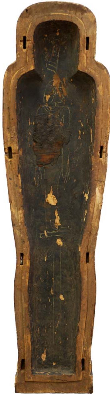
Fig. 4. The Nefer-renepet coffin: b). trough interior (June 4 th , 2013).