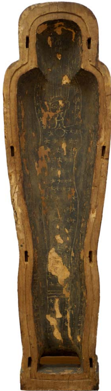
Fig. 4. The Nefer-renepet coffin: a). lid interior (June 4 th , 2013).