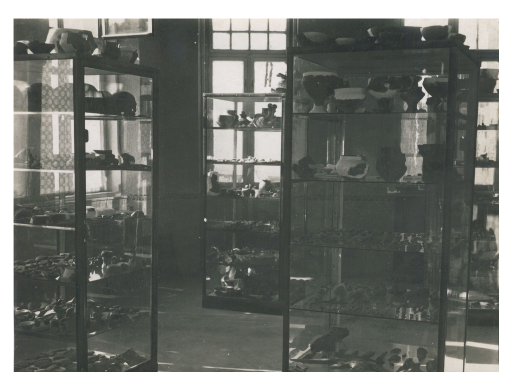
Fig 4. Vinča material exhibited in the Archaeological Collection of the Faculty of Philosophy in 1938 (AAZFF)