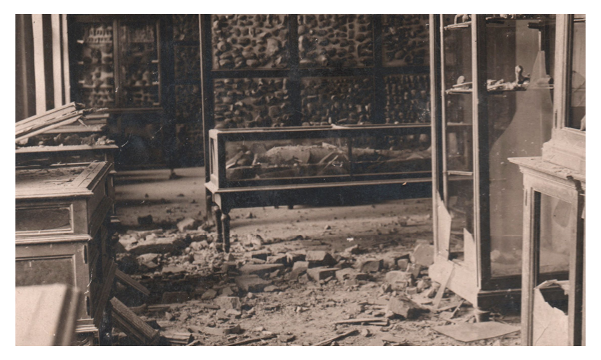
Fig. 1. Photo of the material from Vinča arranged according to the stratigraphic principle in the Museum devastated in 1914 (Mitrović 2015, 409)