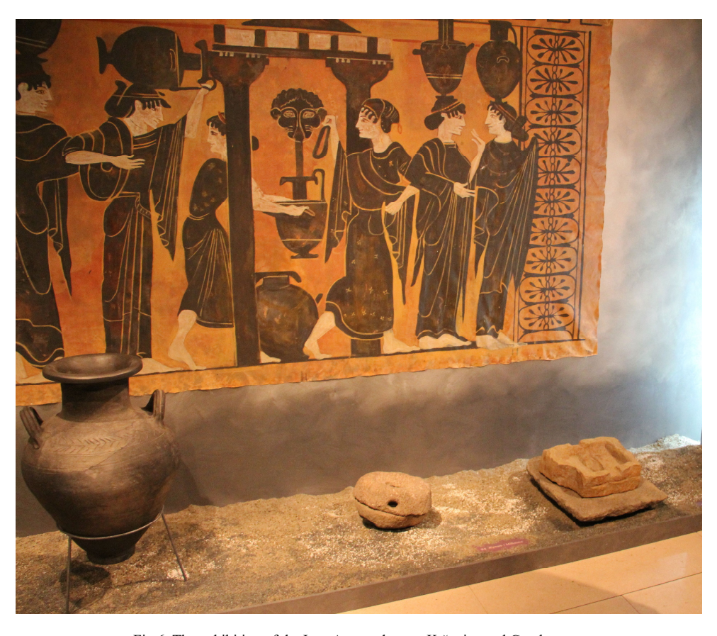
Fig 6. The exhibition of the Iron Age settlement Krševica nad Greek vases (DNM) \label{eq:DNM}