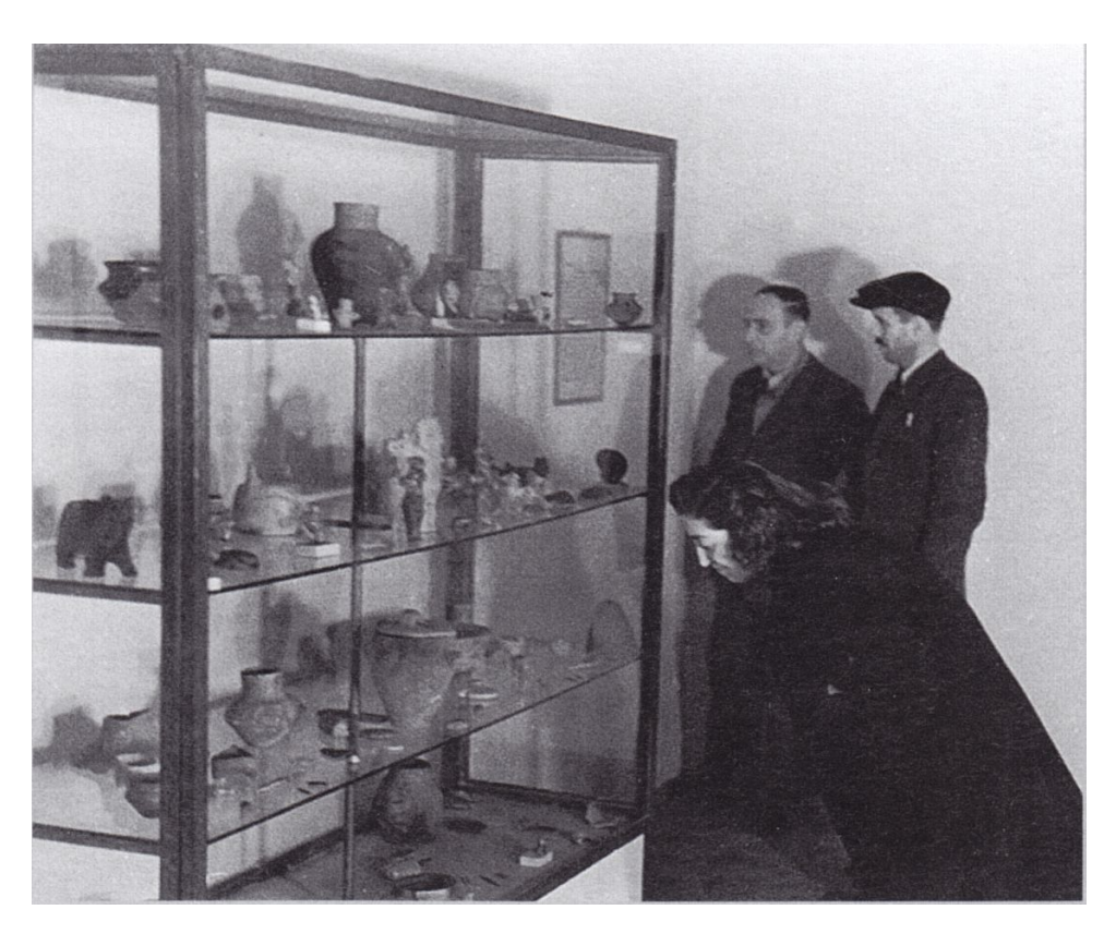
Fig. 3. The Neolithic exhibition in the Prince Paul Museum (Ninković 2009, 139, DNM)