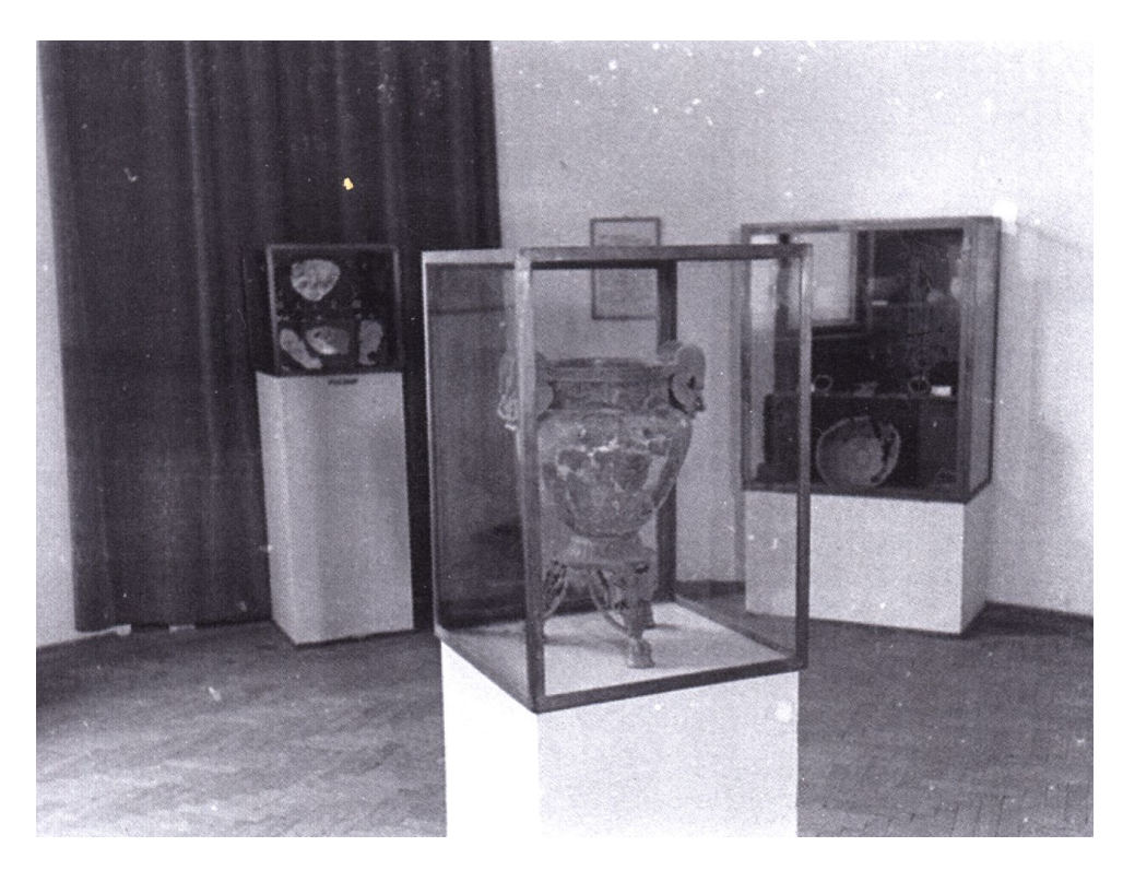
Fig. 5. Finds from Trebenište in the archaeological display of the Prince Paul Museum (Krstić 2018, 41, DNM)