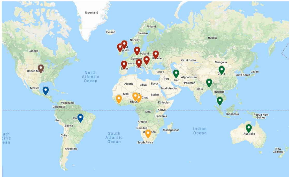
Figure 1: Regional distribution of responding HEIs

The majority of the responding HEIs were founded between 1900 and 2000 (15), while others were either founded between 1800 and 1900 (7) or following the year 2000 (5) making most of the cohort composed of fairly “new universities.” Only one university was founded before 1800.