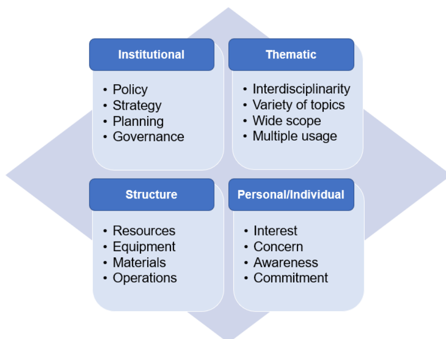
Figure 3: Factors to be considered in order to yield the expected benefits of the SDGs implementation

In addition, Table 9 describes the elements that need to be part of an institutional framework, which may have the ambition to cater to the inclusion of the SDGs.