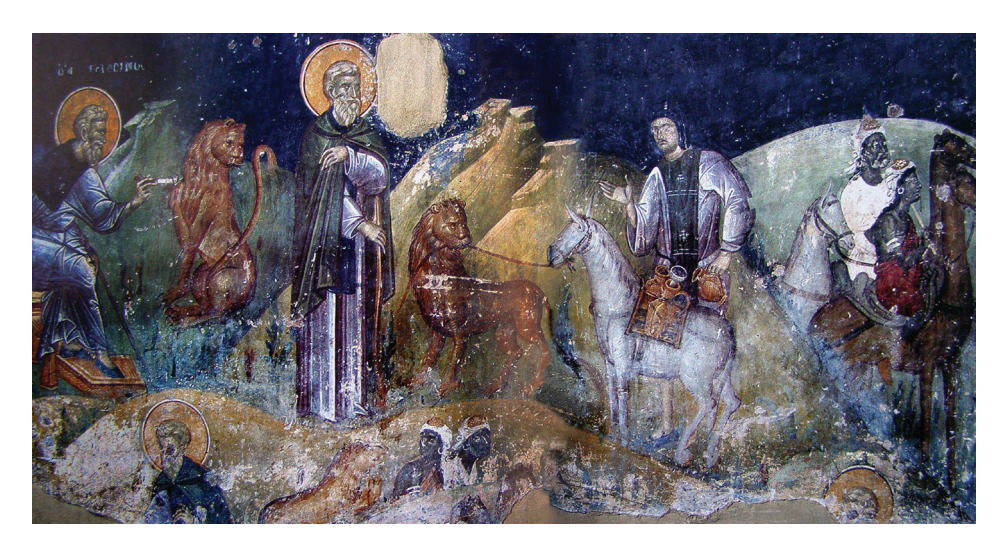
8 Life of St. Gerasimos, fresco, Church of Nicholas Orphanos, Thessaloniki, 14th c.