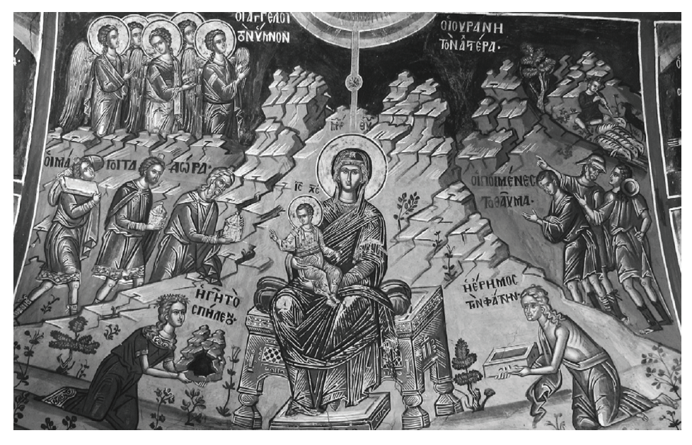
1 The Ascetic Penance, Vat. gr. 394, fol. 46r, 11<sup>th</sup> c.

2 Representation of Nativity Troparion, fresco, Church of the Holy Archangels Michael and Gabriel (central vault), Docheiariou Monastery, 16<sup>th</sup> c.