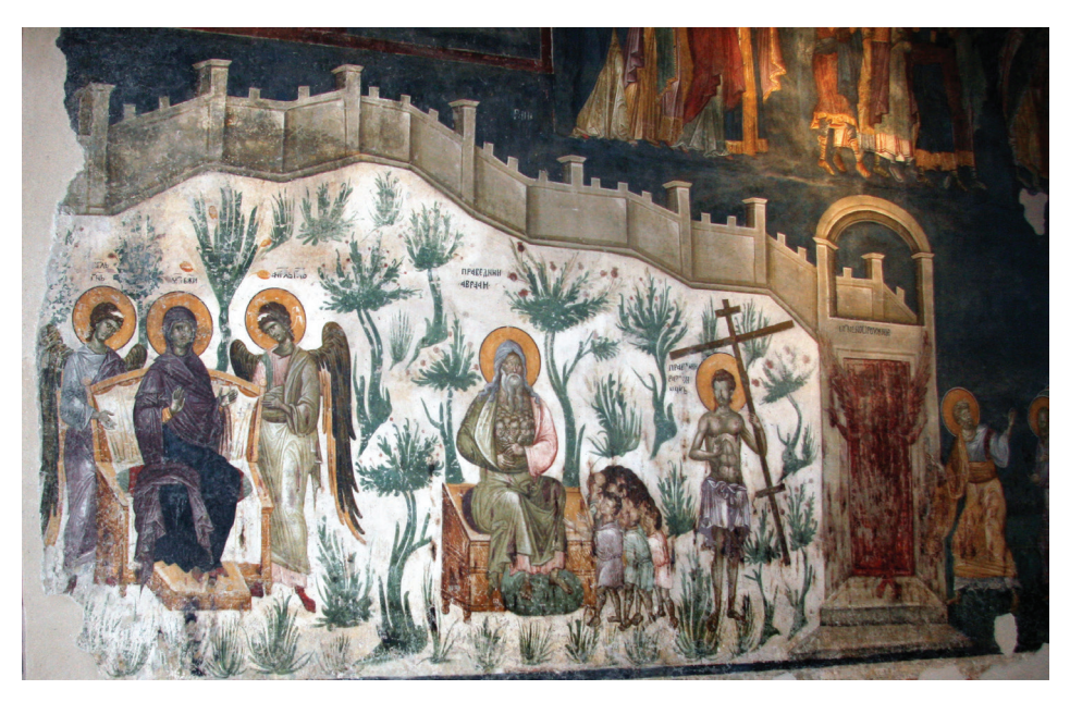
6 Paradise, fresco, narthex of the Church of the Dormition of the Holy Virgin (west wall), Gračanica Monastery, 14<sup>th</sup> c.

human societies is the same ideology which sanctions similar relationship to nature (Goldwyn, 2018, 7-19).