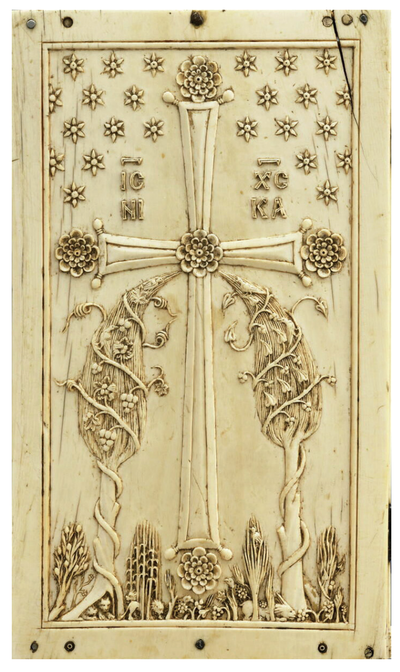
Harbaville Triptych , central panel (verso), ivory, 10<sup>th</sup> c.