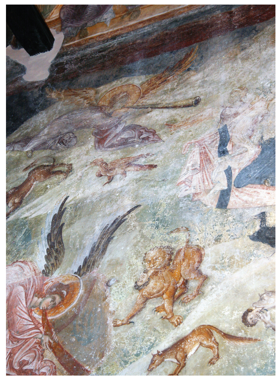
7 General Resurrection, fresco, detail, narthex of the Church of the Dormition of the Holy Virgin (west wall), Gračanica Monastery, 14<sup>th</sup> c.