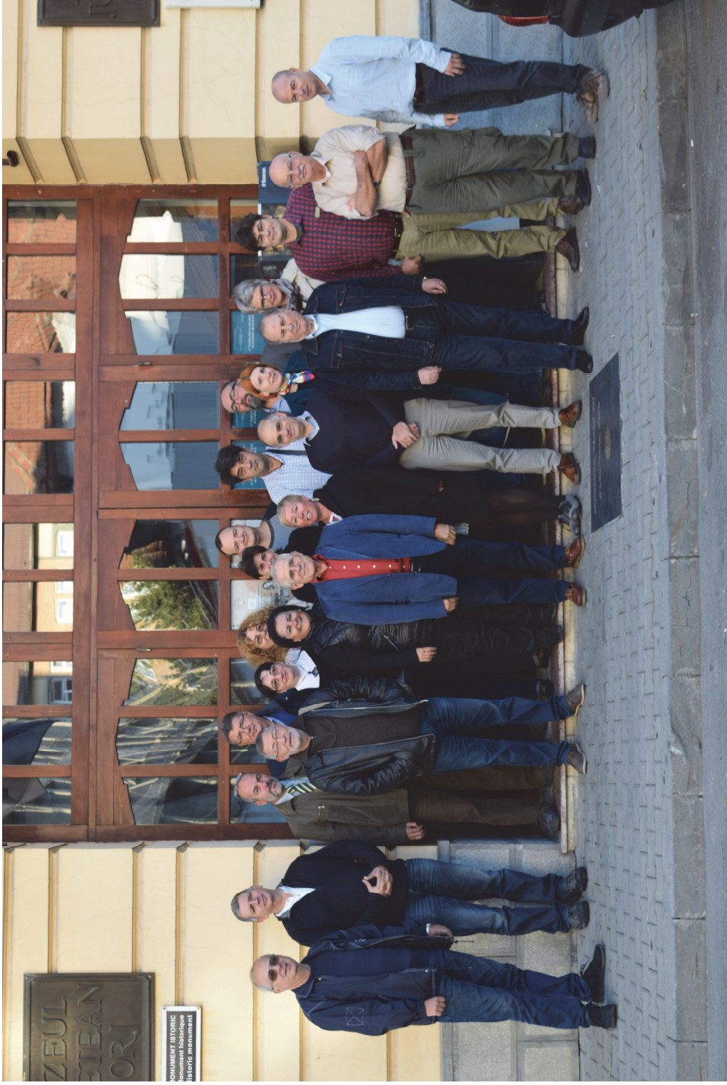
Participants of The 17 th International Colloquium of Funerary Archaeology, Tg. Jiu, 4 th -7 th , October 2018