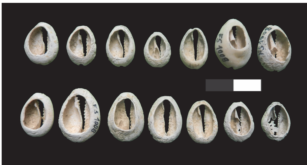
Fig. 2. Cowry shells from Stubarlija, Grave 1.