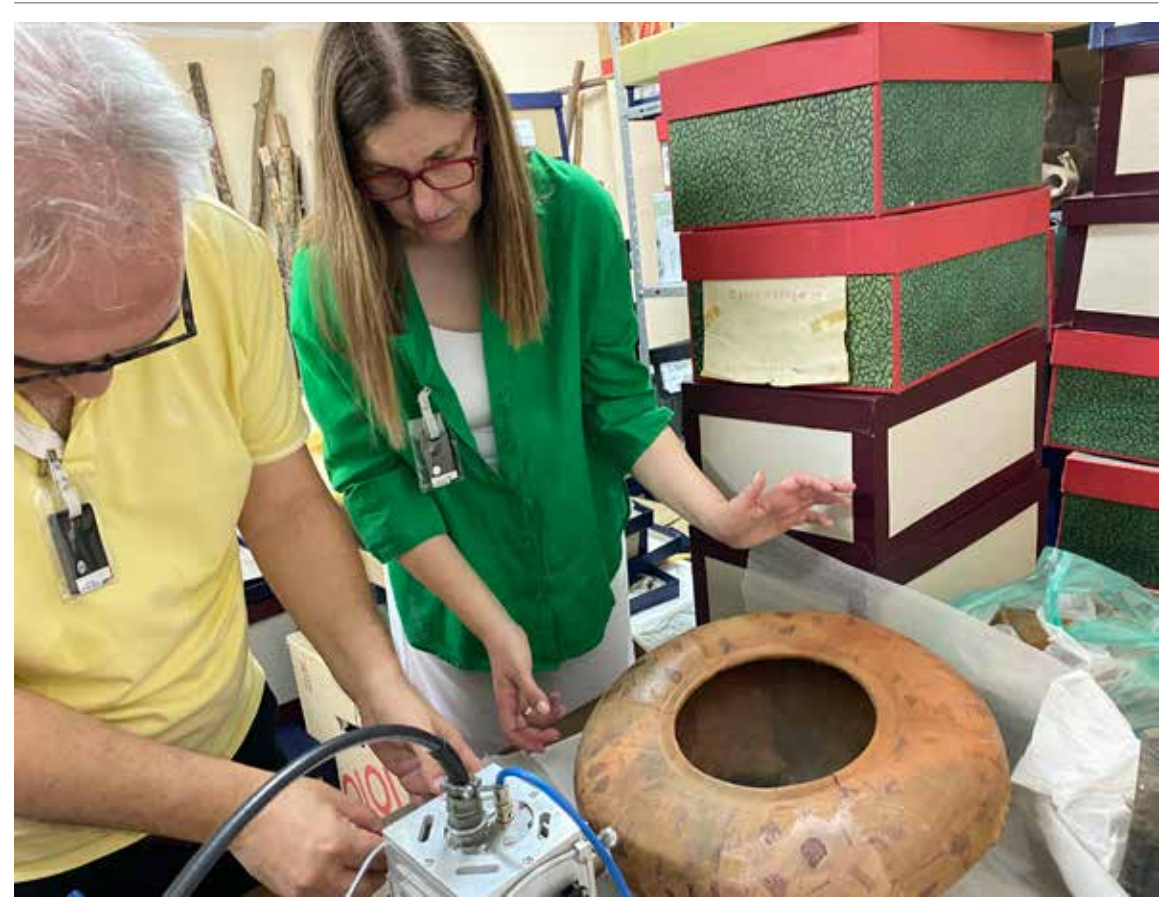
Figure 4. Analysis of the vessels from the Velika Humska Čuka site using the EDXRF spectrometer in the depot of the National Museum, Niš.

sherds, this analysis was conducted on the existing damage of the vessel, by selecting the most suitable spots. Additionally, clay samples collected from two different locations in the vicinity of Velika Humska Čuka were analysed. Based on the analyses of the elemental composition of both the reconstructed vessels and clay samples (detected chemical elements are Si, K, Ca, Ti, Mn, Fe, Rb, Sr, Y, and Zr), a high degree of similarity has been determined (more than 90 per cent according to the hierarchical cluster method). Hence, it can be concluded with a high probability that the vessels were made from local raw clay. The determination of local production includes the analyses of pigments used for the decoration of ceramic vessels. The most interesting example is the motif of a "dancer" painted with red pigment. The EDXRF spectrometric technique determined that cinnabar was used for painting, which is usually rarely used for the decoration of ceramic vessels. By determining the presence of characteristic