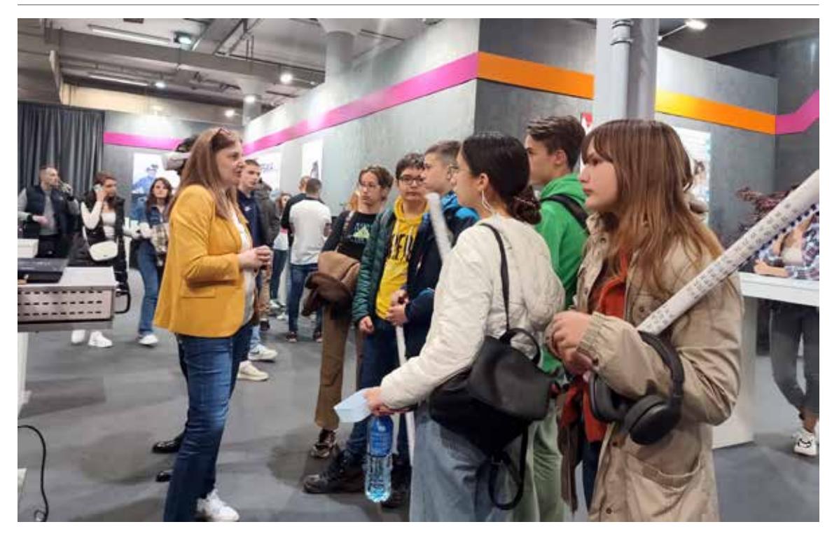
Figure 6. THE FLOW at the 65<sup>th</sup> International Fair of Technics and Technical Achievements, in Belgrade.

source of copper. Further insight into the chemical composition of the samples indicated that the pendants from this set of jewellery possibly originate from the same cast and workshop.