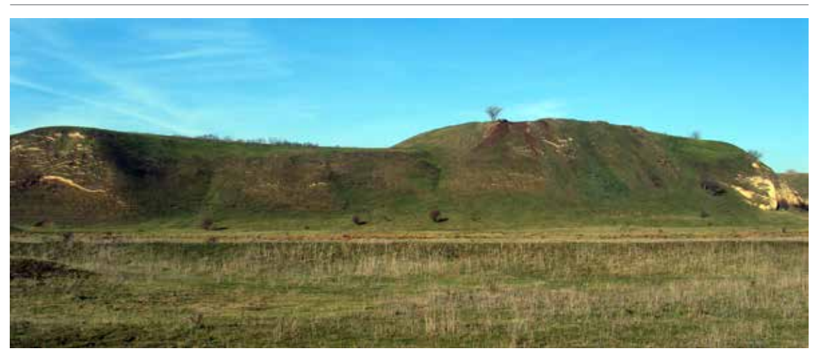
Figure 2. Židovar in Orešac.

poorly researched. Sokolica in Ostra ( Figure 3 ) and Slatina in Gornja Gorevnica (Dmitrović and Ljuština 2021: 155; Љуштина 2022: 140–146) represent two of the few settlements from the West Morava region, which highlights the importance of data on Bronze Age pottery production. Typical Middle Bronze Age pottery recorded in the settlements of Ostra and Gornja Gorevnica