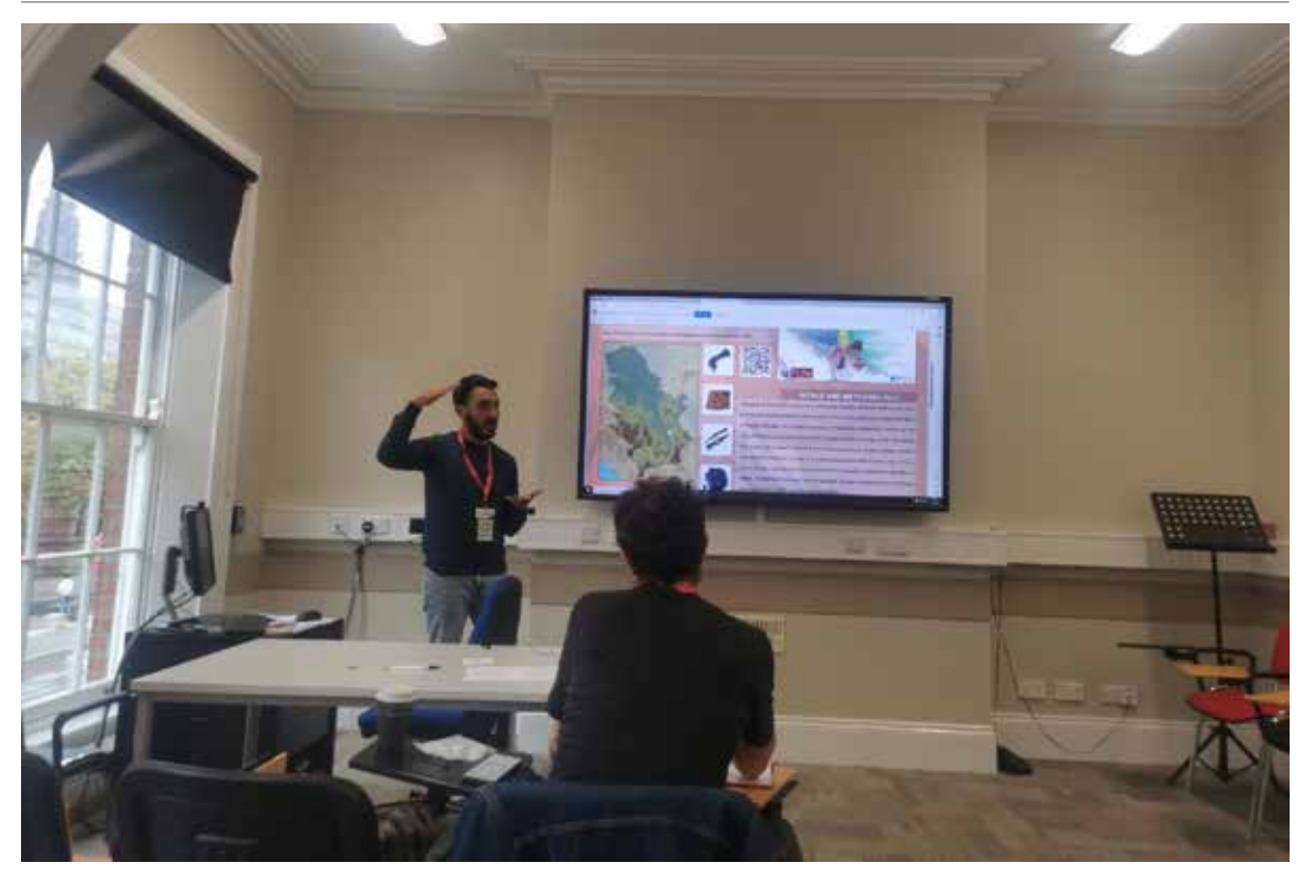
Figure 7. THE FLOW at the 29<sup>th</sup> European Association of Archaeologists meeting in Belfast, Northern Ireland.

composition of both the vessels and the clay pits was determined using an EDXRF spectrometer and the level of elemental similarity between the pots and the clay samples was quantified by hierarchical cluster analyses (HCA). The results have indicated that the vessels originated from one of the clay pits (clay sample No. 1), and that the vessels were made on-site using locally available raw materials.