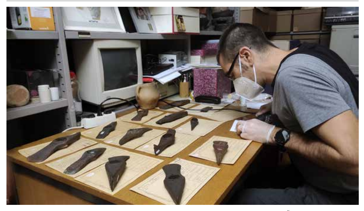
Figure 1. Sampling of copper and bronze artifacts at the National Museum, Šabac.

of scientific collaborations, that can be continued through future joint projects and applications on international calls (e.g., Horizon EU).