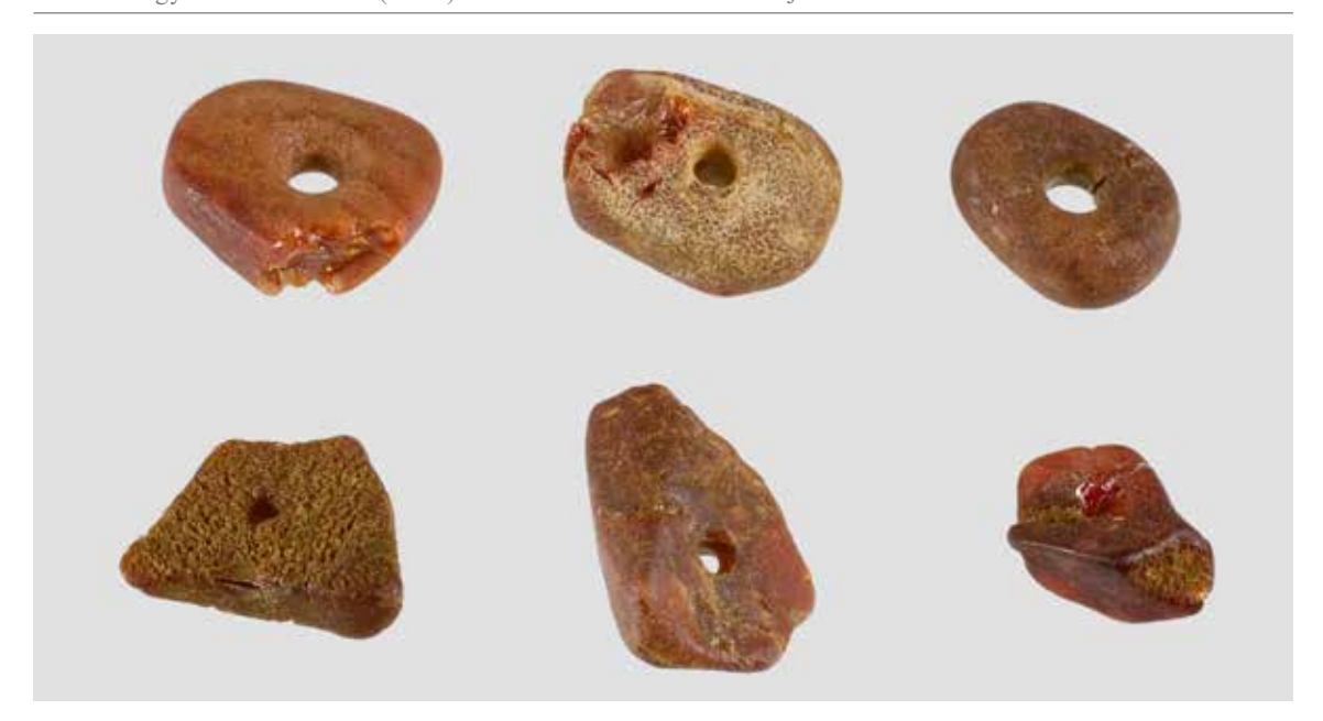
Figure 8. The analysed amber from the central grave of Mound K at the Paulje necropolis (after: Палавестра и Крстић 2006).

networks in the Central Balkans during the Copper and Bronze Age.