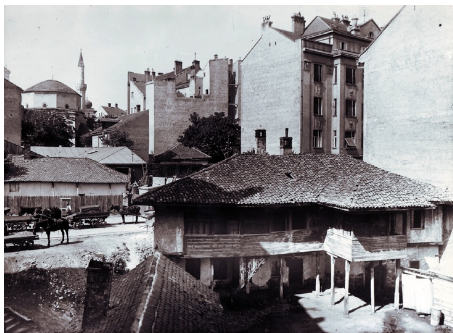
Figure 3: Mix of architectural styles: a view of Dorćol from Jovanova Street, in the first half of the 20th century 8

Stevan Sremac (1855-1906), Serbian writer