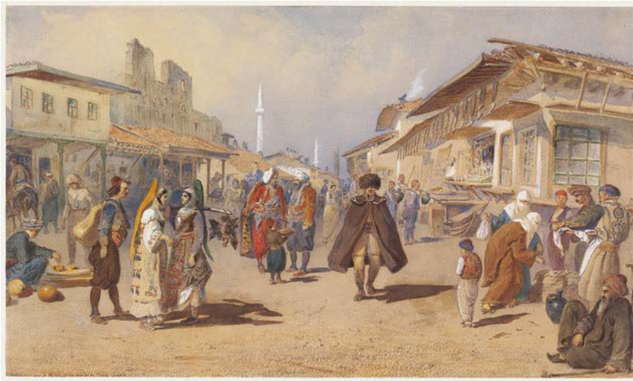
Figure 4. Ethnographic medley: Bazaar in Dorćol. In the bottom left of the picture can be seen the ruins of "Pirinčana", the court of Prince Eugene of Savoy from the 18th century.

Turks , led by Sultan Suleiman the Magnificent, managed to conquer Belgrade at 28 August 1521. Since that time the Belgrade Turks , as the ruling class, were, in a political and socio-economic sense, the largest and most dominant group. A minority of these Turks were "real" Ottoman Turks from Anatolia, while the majority was Bosnian Turks. Other Muslim groups lived side by side with them, namely Circassians, Pomaks, and Tatars. The complicated ethnic structure of the Belgrade Turks resulted in their differentiation in terms of economic and social status. When the Turks left Belgrade in 1867, few stayed behind, and Dorćol, where they had for the most part previously lived, was almost deserted. Over time, the numerous mosques in Belgrade were torn down, and today the only active mosque from this time is the Bayrak Mosque 10 in Jevremova Street, built in the 16th century, which used to be the meeting place of pilgrims before their departure for Mecca. Today, along with Islamic Community of Serbia there are some educational institutions such as Faculty of Islamic Studies and the madrasah.