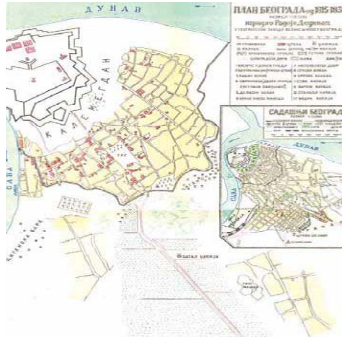
Figure 2. A plan of Belgrade 1815-1830. 6

Upper Dorćol, originally called Zerek (which in Turkish means "vista" because the Danube and all the surrounding area was visible from there), was a busy trade center and hub of social life – old downtown or bazaar – which remains basically unchanged to this day. The heart of this area is the above-mentioned Kralja Petra Street and Jevremova Street. These streets were well known, since many of the most influential people of different ethnic origins had houses there, as well as some of the most important cultural institutions are located here. Lower Dorćol extends over the area below Dušanova Street all the way to the Danube bank. It used to be called Jalija