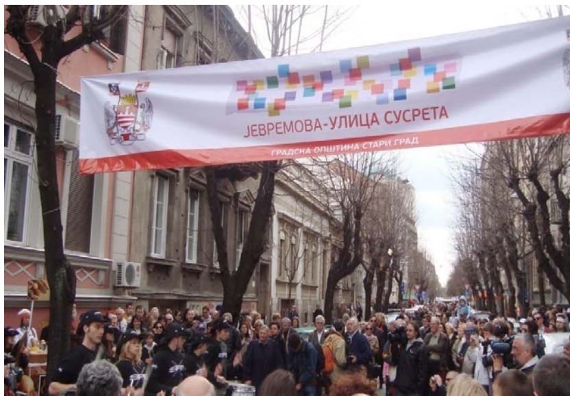
Figure 5. Jevremova – Street of Meetings, April 2009.

The first proclamation issued on 12 April 2009 states the reasons for organizing this event: "To live in the Stari Grad municipality, in Zerek , Dorćol or in Jevremova Street , is not an imaginary privilege but a true blessing. The mission to rescue from oblivion long-gone neighbors – Celts, Greeks, Romans, Armenians, Turks, Tsintsars, Jews (...) is a great treasure that must be preserved and cherished... The principal idea was to revive the spirit of early nineteenth-century urban Serbia... The Jevremova – Street of Meetings event aims to promote the preservation of cultural and historical heritage, but also of civic values and culture for the neighborhood in contemporary circumstances." 15