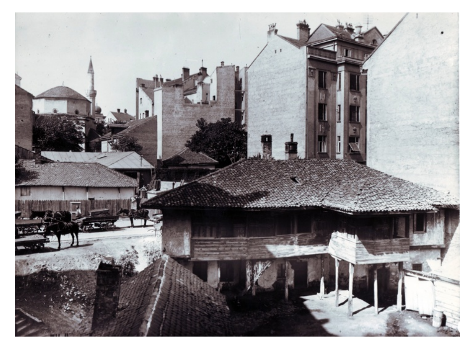
Figure 3: Mix of architectural styles: a view of Dorćol from Jovanova Street, in the first half of the 20th century<sup>8</sup>

Stevan Sremac (1855-1906), Serbian writer