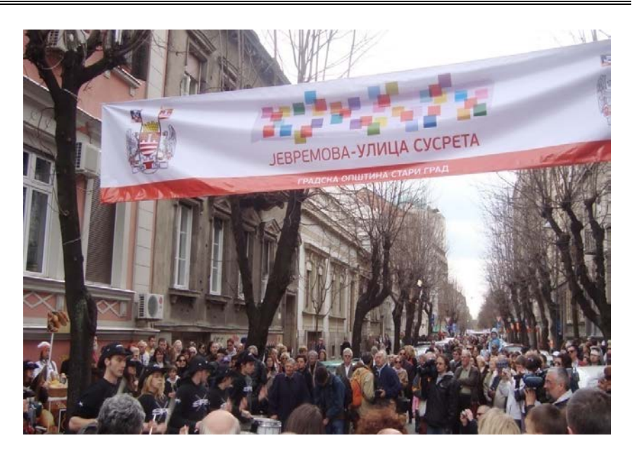
Figure 5. Jevremova - Street of Meetings, April 2009.

The first proclamation issued on 12 April 2009 states the reasons for organizing this event: "To live in the Stari Grad municipality, in Zerek, Dorćol or in Jevremova Street , is not an imaginary privilege but a true blessing. The mission to rescue from oblivion long-gone neighbors – Celts, Greeks, Romans, Armenians, Turks, Tsintsars, Jews (...) is a great treasure that must be preserved and cherished... The prinicipal idea was to revive the spirit of early nineteenth-century urban Serbia... The Jevremova – Street of Meetings event aims to promote the preservation of cultural and historical heritage, but also of civic values and culture for the neighborhood in contemporary circumstances."<sup>15</sup>