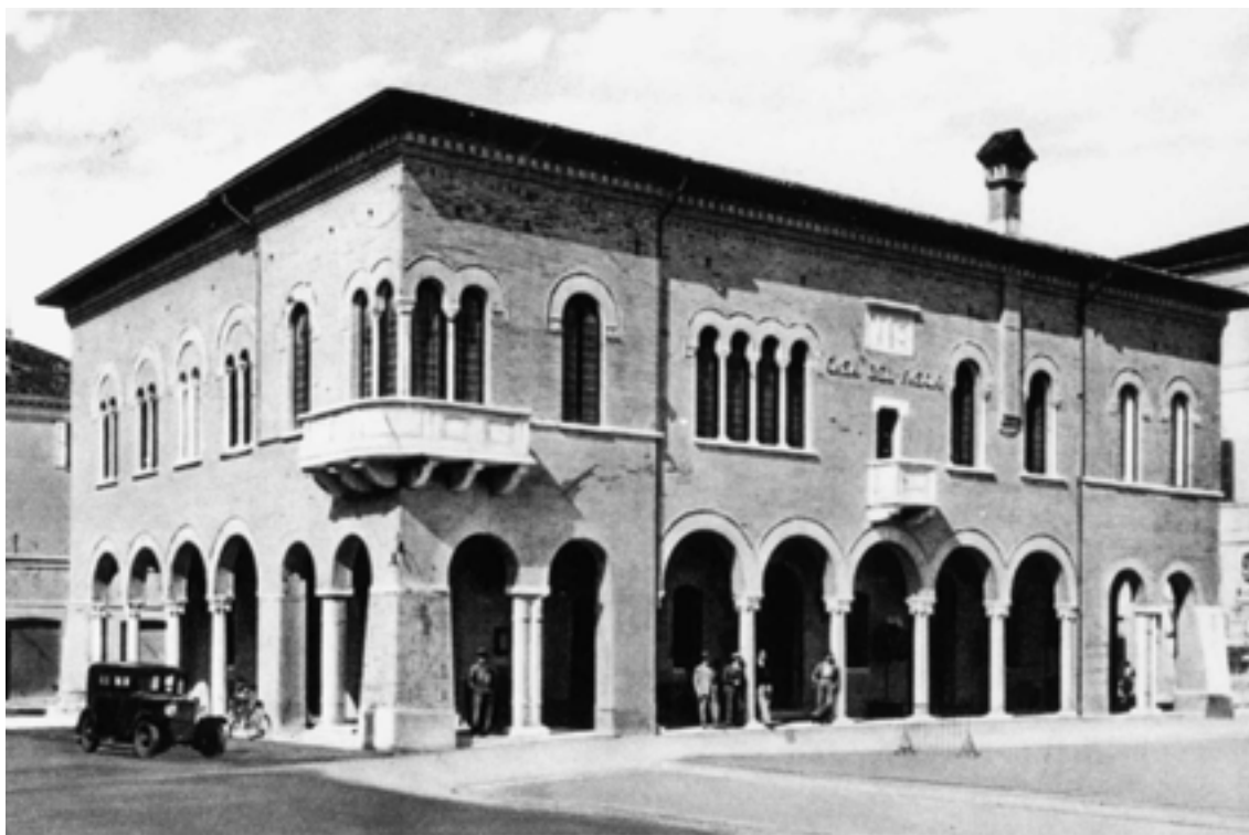
Fig. 1. Unknown author, Casa del Fascio in Alfonsine, 1929.

Fascio in Italy (Fig. 1) or Halkevleri in Turkey during the same period. Architectural identity formed a picture of desirable values and ideals that were to be a part of national culture. National style was used both in Italy and in Turkey, and was very similar to Yugoslav concept of returning to national tradition and glorifying a healthy, national culture. Therefore, Sokol house had the same role as Casa del Fascio, for example. Both of them had a central auditorium with a stage, a library and their main purpose was to educate and influence youth of their country. The same situation was present in Turkey, which also had a totalitarian regime. In these countries, as well as in Germany, during the 1930s there was a strong campaign considering pre-military physical training of the youth, which was partly expected from Sokol Union in Yugoslavia. 3