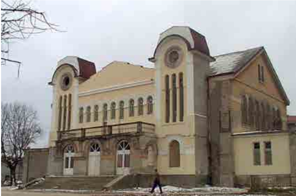
Fig. 3. Momir Korunović, Sokol house in Kumanovo, 1931.

manovo from 1931 (KADIJEVIĆ 1996: 71–72). (Fig. 3) Sokol house in Uroševac also has elements of traditional architecture, such as a doksat, a four-sloped roof and an arcade porch (KADIJEVIĆ 1997: 122–123). Apart from these examples, Korunović projected a certain number of Sokol houses on the territory of Bosnia and Hercegovina which were inspired by local architecture, such as Sokol house in Bijeljina (KADIJEVIĆ 1997: 308).