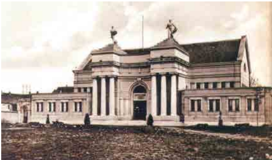
Fig. 2. Dragiša Brašovan, Sokol house in Zrenjanin, 1925.

Korunović applied monumental geometrical shapes that were inspired by folklore ornaments. Many of his Sokol houses in correspond with local heritage, like Sokol house in Ku-