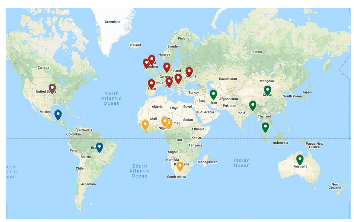
Figure 1: Regional distribution of responding HEIs

The majority of the responding HEIs were founded between 1900 and 2000 (15), while others were either founded between 1800 and 1900 (7) or following the year 2000 (5) making most of the cohort composed of fairly "new universities." Only one university was founded before 1800.