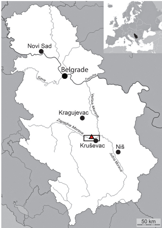
Fig. 1. Map of Serbia showing position of the Kruševac Basin (black rectangle), and Bela Voda site (red triangle).

Gomphotherium and the mammutid Zygodont , which were among the earliest proboscideans to arrive in Europe at the end of MN3 (early Orlanian; MEIN, 1999), with the record of the deinother Prodeinotherium bavaricum from Lesvos island (Greece) as early as MN3b (KOUFOS et al., 2003). However, dental specimens from the late Early and Middle Miocene of Europe frequently show mixtures of bunodont and zygodont features, making their taxonomical attributions rather difficult and subjective (TOBIEN, 1972; MAZO, 1996). Among the multitude of elephantoid specimens recorded in the Neogene of Serbia (PAVLOVIĆ, 1981, 1998), only a small number of specimens show these “intermediate” morphologies. In this paper, we describe and examine a fragmented elephantoid molar with intermediate morphology, discovered recently in Central Serbia. In order to minimize the subjectivity in our assessment of the specimen’s zygodonty, we applied a new, semiquantitative method suggested by WANG et al. (2016). The specimen originated from the Kruševac Basin, a semi-isolated Neo-Alpine tectonic depression (graben), mostly filled with thick Early and Middle Miocene lacustrine clastics (KNEŽEVIĆ, 1997; MAROVIĆ et al., 2007). These sediments have been known for the abundance of pro-