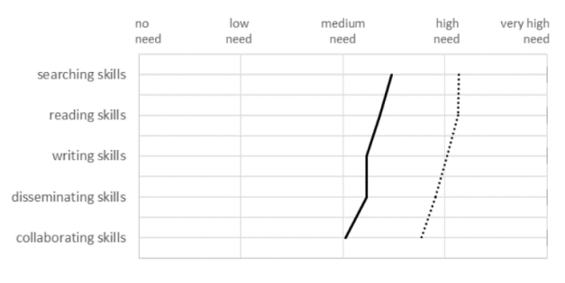
self assessment students, all ••••••• external assessment lecturers, all

The results of our surveys showed that evaluations of students and lecturers show close similarities regarding the need for improvement in 5 sub-skills of research literacy. Two general trends are observed at this level of comparison (Figure 1). On the one hand, the two trend lines (showing the means of self-assessment of students, and the external assessment of lecturers) follow a similar pattern, showing rather high levels of needs, which slightly decrease in the sequence of skills. On the other hand, self-assessments of students and external assessments by lecturers differ in their extents. Students and lecturers agree how to rank the different sub-skills, but they differ on the extent to which they perceive needs for improvements. Lecturers tend to note much higher needs for improvement of students' literacy skills than students themselves do. We will discuss further findings in detail.