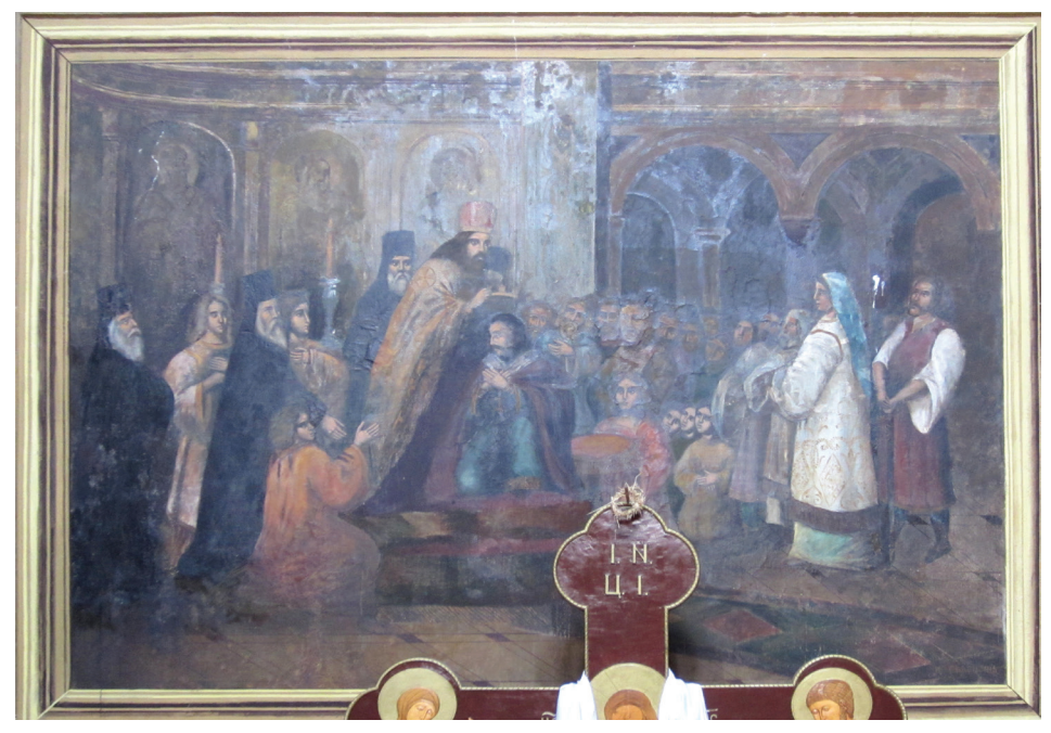
Fig. 9. The Coronation of the First Serbian King, Stefan the First-Crowned, the northern wall of the church

in the Serbian-Turkish war 1876, fighting with the fraternal Serbian people in the final liberation from the Turks. He died as a hero for the Serbian national cause and the Orthodox faith, as well as Prince Lazar, who is depicted under his portrait as a martyr with a severed head in his hand.