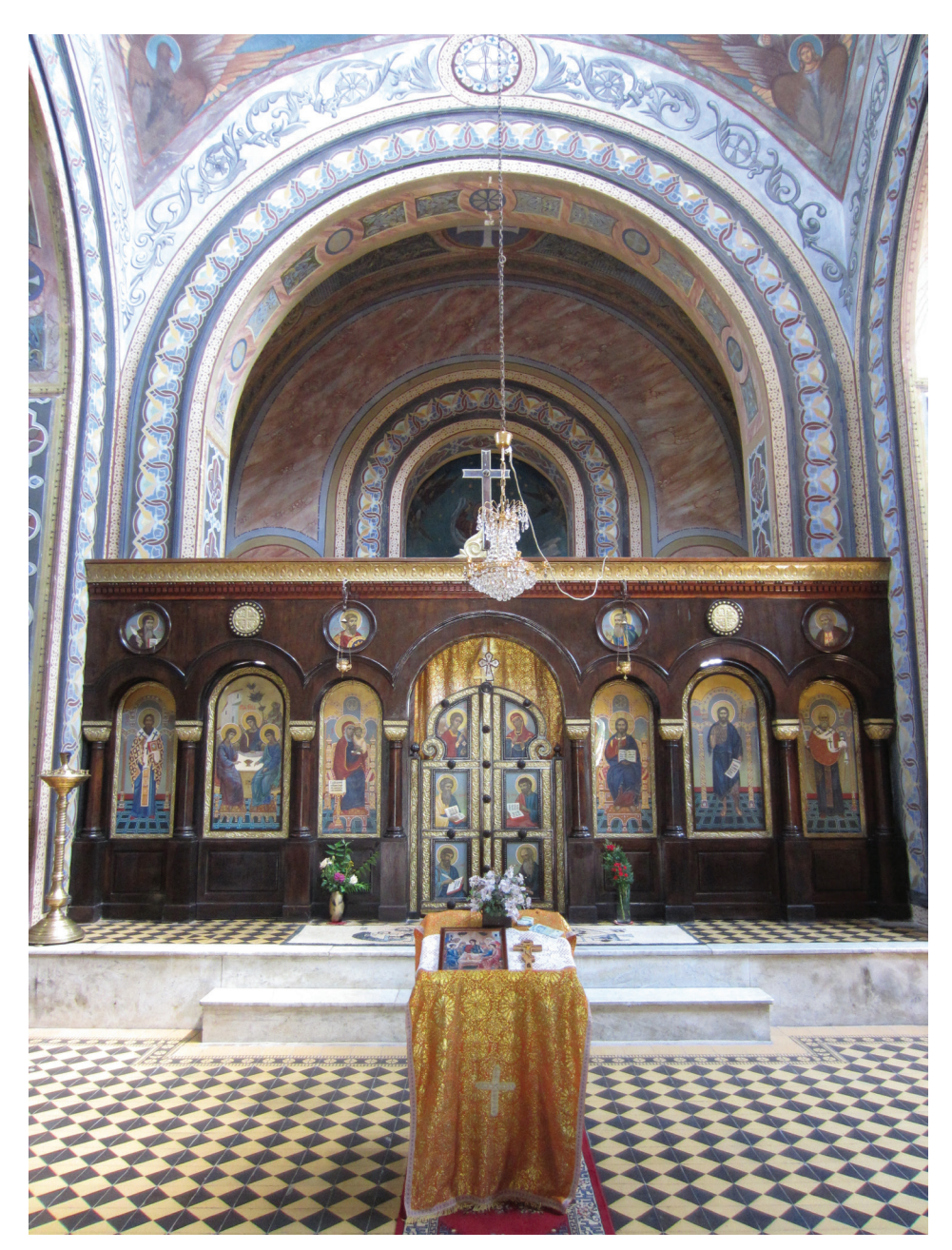
Fig. 6. Interior of the memorial church in Gornji Adrovac