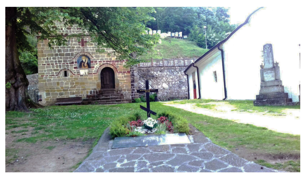
Fig. 1. The grave of Colonel Nikolay Revsky in St. Roman monastery, photo A. Kostić