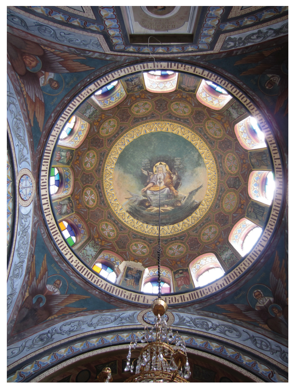
Fig. 10. The wall painting of the dome in a memorial church in Gornji Adrovac