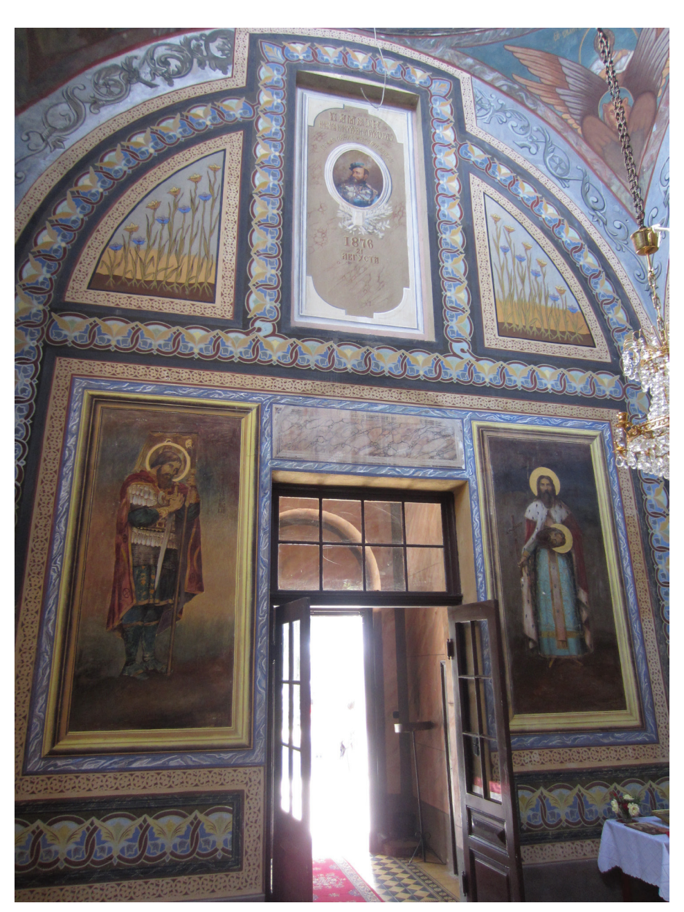
Fig. 8. Saint Alexander Nevsky, Saint Prince Lazar, and medallion with a portrait of Colonel Raevsky, the western wall of the church