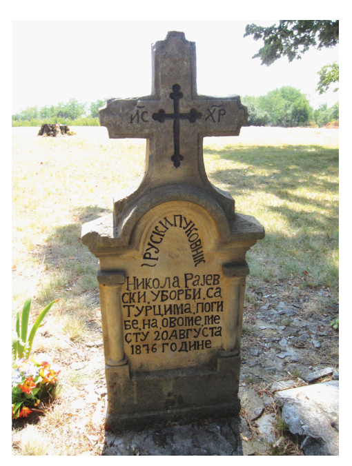
Fig. 3. The monument that commemorates the place where Colonel Raevsky was killed in Gornji Adrovac

Russian court in 1881, he was received coldly and with rejection by the Russian Emperor, Alexander III (Ћоровић, 1999, pp. 657–658). Since Russia confirmed its policy at the Congress of Berlin, where it stood by the interest of Bulgaria at the expense of Serbia, Prince Milan went into political negotiations with Austria. He signed a secret convention purporting mutual and friendly politics between the two countries (Јовановић, 1927, pp. 56-59; 1935, pp. 207–215). Thus, Serbia was responsible for preventing the eventual political intrigues against the Austrian monarchy on its territory. In return, Austria was about to proclaim Serbia a kingdom among other European forces, which happened in 1882 (Јовановић, 1927, р. 136). From that point, the rule of King Milan was marked by Austrophile politics and reckoning with the supporters of Russia, which eventually led to the exile of two strong Russophiles and political